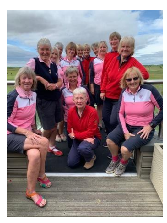
Lancashire and Cumbria team players and caddies with officials