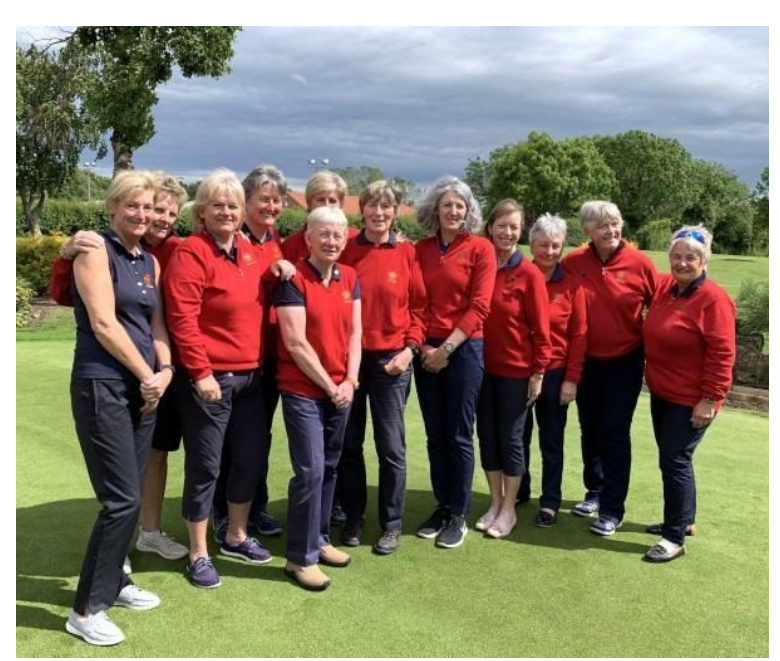
NORTHUMBERLAND MATCH 19th JUNE

On to Northumberland, and I for one hoped that the Angel of the North would continue to smile upon us as we sped past. Westerhope Golf Club was quite similar to the lay out at Blackwell Grange. Lush green