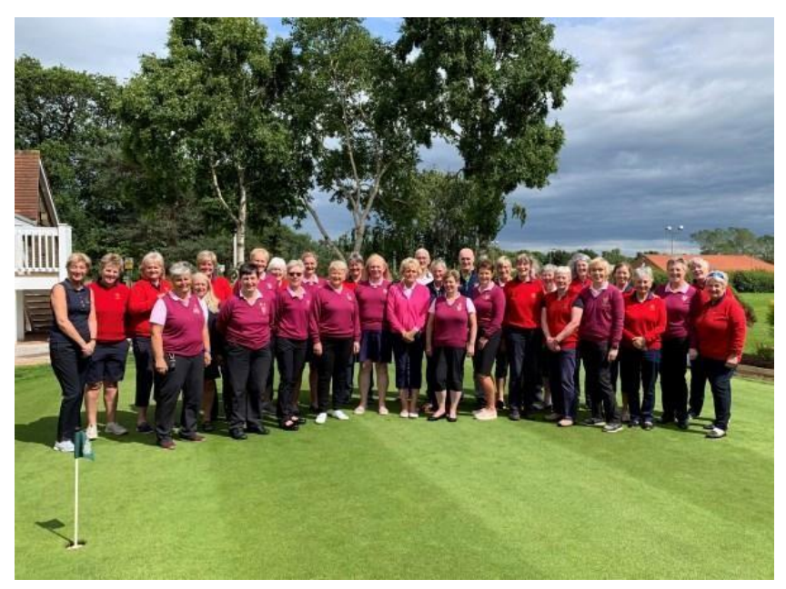
Both teams outside the club house after the match