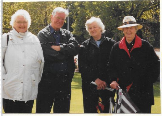
President and Vice Captain ready to watch final with W.G.C Lady Capt. with her broken arm.