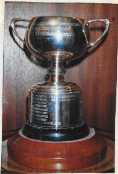
The Richardson Trophy.

Trophies. { The Championship ~ started 1938 - see Book I The Silver Slipper ~ started 1949 ~ see Book I The Richardson - started 1950 - see Book I The Miller-Stirling ~ started 1960 - see Book II The Cecil Leitch ~ started 1963 - see Book II The Bronze ~ started 1995 - see Book V