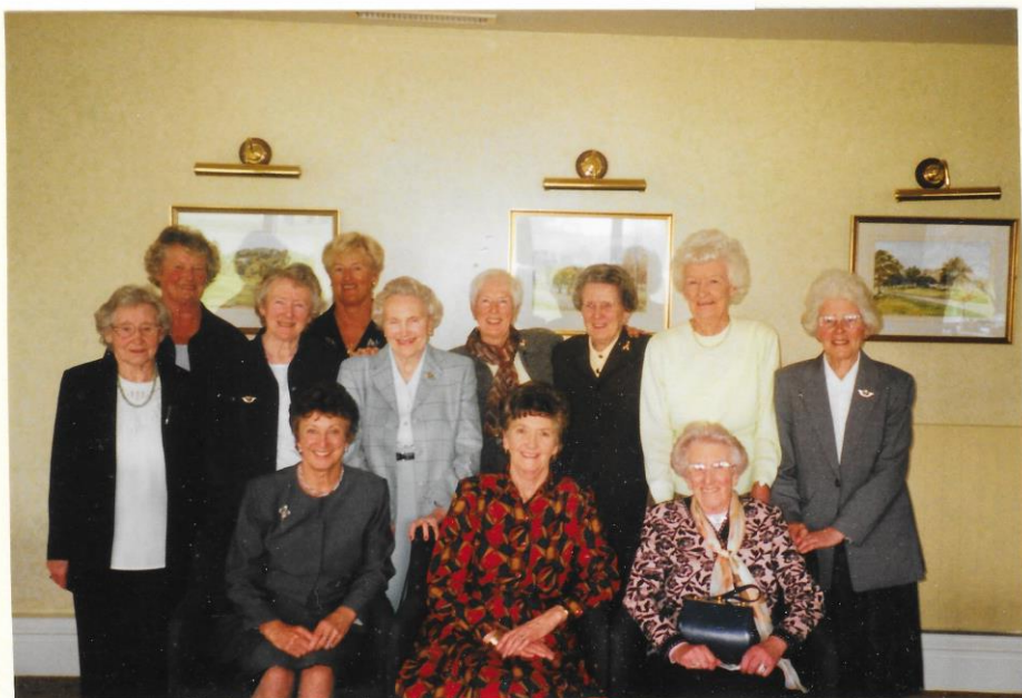
INAUGURAL PAST CAPTAINS CAPTAINS LUNCHEON. Pleasington G.C. 2nd April 2001.