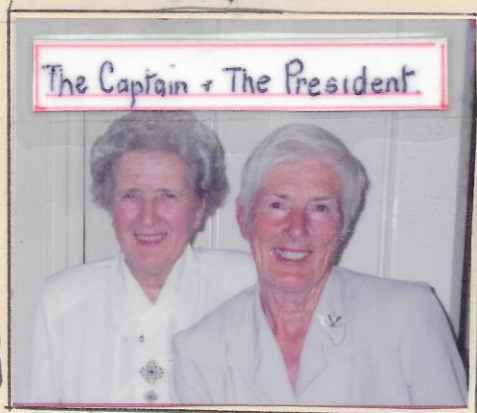
The Captain + The President