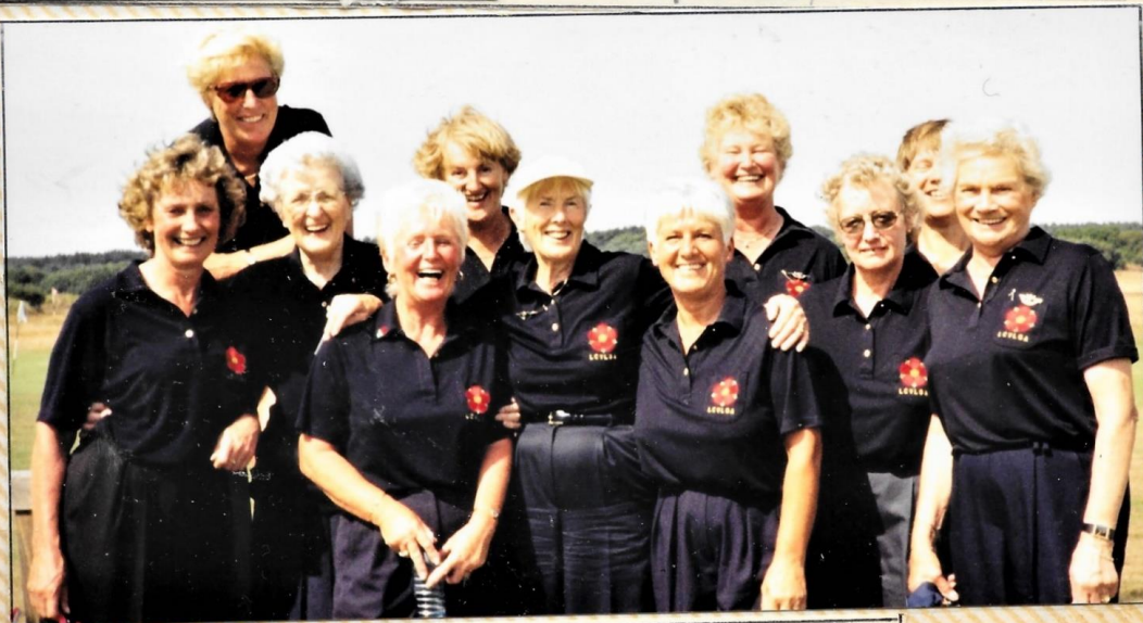
The Victorious Richardson Trophy Team and Officials