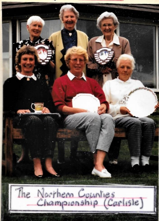
The Northern Counties Championship (Carlisle)