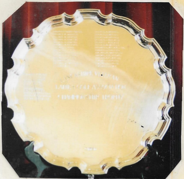
Championship Trophy (L.C.V.L.G.A.)